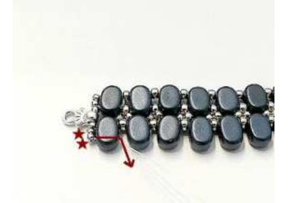
17) Pick up 2 SB15 and exit through the first Lipsi HERE