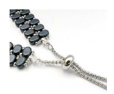
21) Place the clasp © Congratulationsi! You have finished your bracelet Esmée ©

I wish you a happy beading. I offer you this pattern. Please do not change its drawing and only use Les Perles par Puca®- Paris If you publish or share this pattern, thank you for not forgandting to notify that it is Puca® who created it.